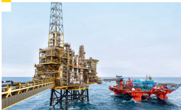
The Shearwater gas platform off the coast of Scotland in the UK North Sea.

The Directors' authority under this resolution will expire at the earlier of the close of business on August 24, 2017, and the end of the AGM of the Company to be held in 2017. The Directors have no present intention to exercise the authority sought under this resolution.